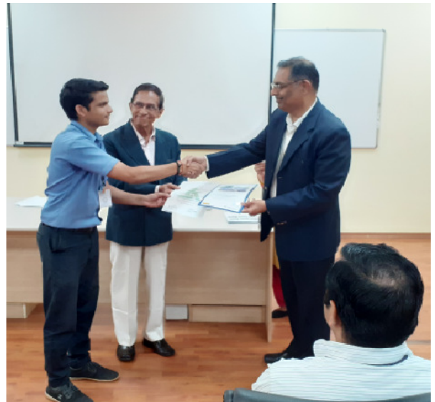
22 ~ 24 Jan 2020: Program conducted for ITI students at L&T Training Center Bhosari fully funded by AASCI total 17 students of PCMC ITI (wiremans' senior batch) took benefit of this program.