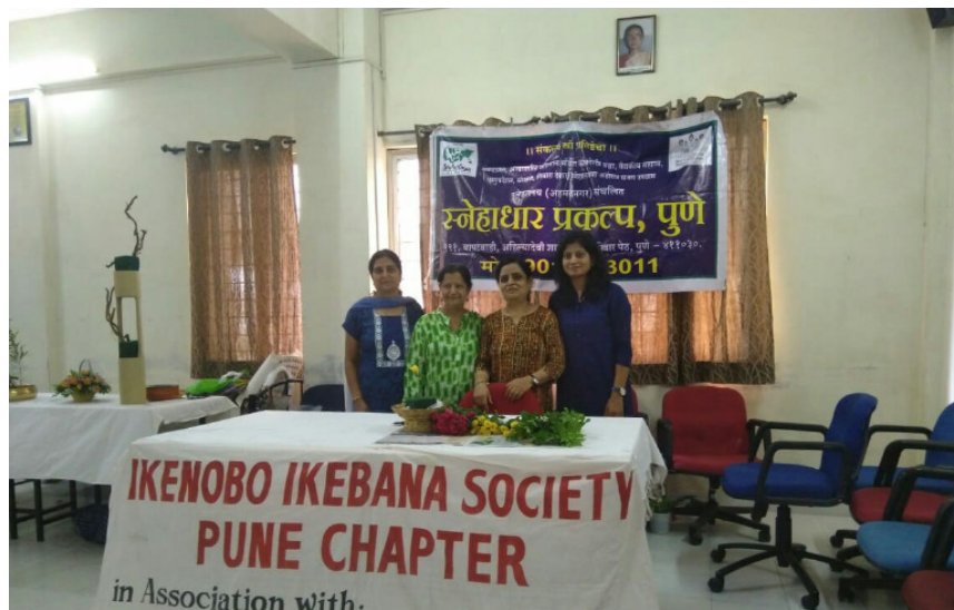
OUR IKEBANA TEACHERS

08 TH JUNE 2019 – IKENOBO IKEBANA SOCIETY, PUNE CHAPTER GOT AN OPPORTUNITY TO DEMONSTRATE FLOWER ARRANGEMENTS. THIS DEMONSTRATION WAS HELD AT WELL KNOWN NGO IN PUNE 'SNEHADHAR ORGANIZATION' AN ORPHANAGE FOR GIRL CHILD AND DESTITUTE WOMEN.